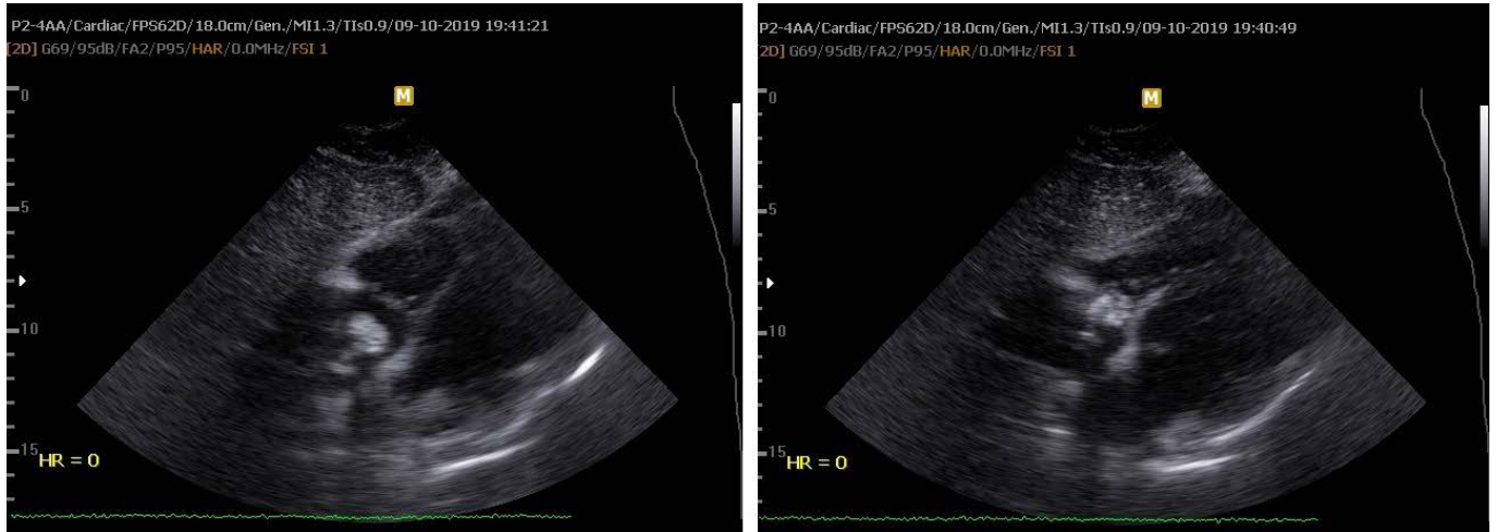
FIGURE 1. Images of transthoracic echocardiography, subcostal view, showing an inhomogeneous mass in the right atrium that prolapses in the right ventricle during diastole

iron deficiency anemia (hemoglobin at 10.2 g/dL) and thrombocytosis at 561,000/ \mu L. Transthoracic echocardiography revealed an echogenic, inhomogeneous mobile mass of 35/20 mm, with irregular contour, attached to the interatrial septum through a small pedicle (Figure 1).